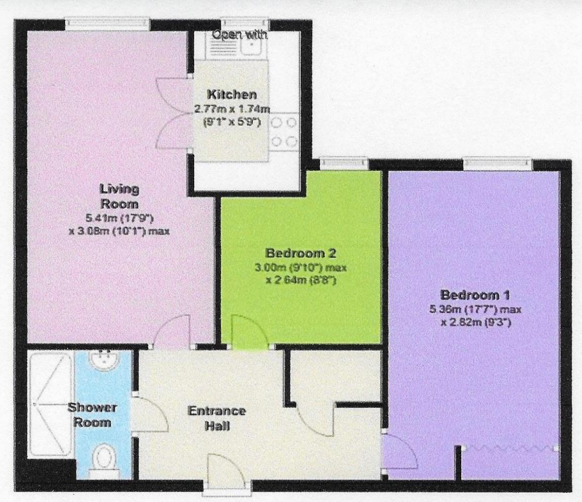
Total area: approx. 57.6 sq. metres (620.0 sq. feet)

This floor plan is for illustrative purposes only and is not to scale. Where measurements are shown, these are approximate and should not be relied upon. Total square area includes the entirety of the property and any outbuildings/garages. Sanitary ware and kitchen fittings are representative only and approximate to actual position, shape and style. No liability is accepted in respect of any consequential loss arising from the use of this plan. Reproduced under licence from Evolve Partnership Limited. All rights reserved.